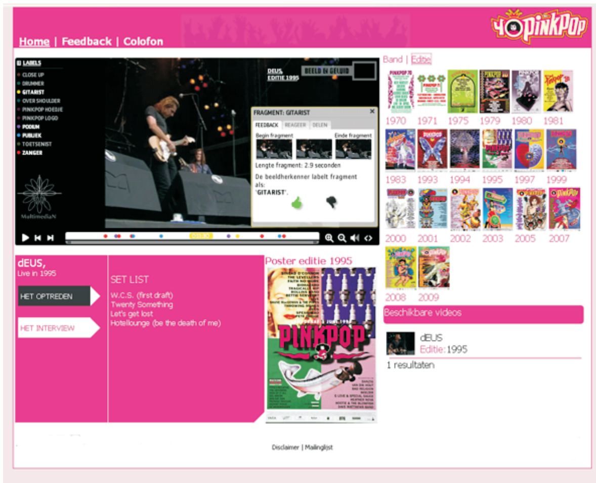
Figure 5: User interface of the multimedia search engine for rock n' roll video. Core component is the crowdsourcing mechanism (Figure 1), which relies on online users to improve, extend, and share, automatically detected results in video fragments using an advanced timeline-based video player (Figure 2). Users may select a concert using the navigation panel on the right. For retrieved concerts, meta-data such as the set list and an interview with the artists is highlighted. The search engine has been operational online to harvest valuable feedback from rock n' roll enthusiasts at http://www.hollandsglorieoppinkpop.nl/ (includes video).