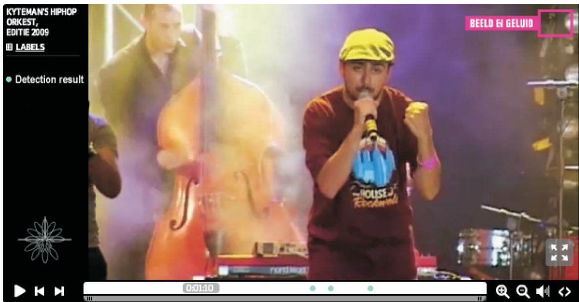
Figure 2: Timeline-based video player with visual detection results marked by colored dots. In addition to standard video playback functionality, users can navigate directly to fragments of interest by interaction with the colored dots, which pop-up a feedback overlay as displayed in Figure 1.

online users to participate by providing them with access to a selection of exclusive, full-length concert videos. The users watch the videos without interruption and are encouraged to provide their feedback by graphical overlays that appear on top of the video, see Figure 1.