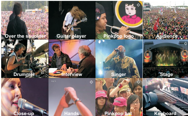
Figure 4: Visual impression of 12 common concert concepts that we detect automatically, and for which we ask our users to provide feedback.

chose 12 concert concepts based on frequency, visual detection feasibility, previous mentioning in literature [3, 10], and expected utility for concert video users. For each concept we annotated several hundred of examples using the annotation tool depicted in Figure 3 [1]. The 12 concert concepts are summarized in Figure 4.