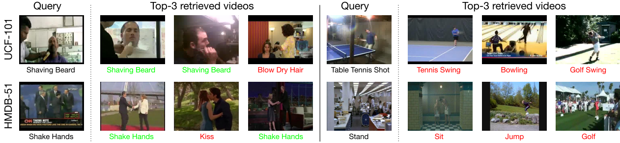
Figure 1: Success and failure examples for video retrieval. The left examples show top-retrieved videos belonging to the same action class as the query video. On the right, all three retrieved videos are from a different class. While our model may retrieve videos from different action classes, it still captures distinctive motion patterns like hand motion and human poses.