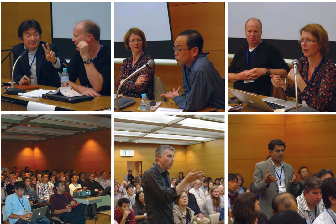
Figure 1. Panelists and audience during the panel debate at ACM Multimedia 2012.

activities to translate Wikipedia and other documents to many languages (see http://en.wikipedia.org/wiki/Duolingo ). The infusion of human intelligence into the content analysis process is achieved by either a community of people or a group of crowdsourcing workers. Such human-in-the-loop processes will help in both understanding content and disambiguating context.