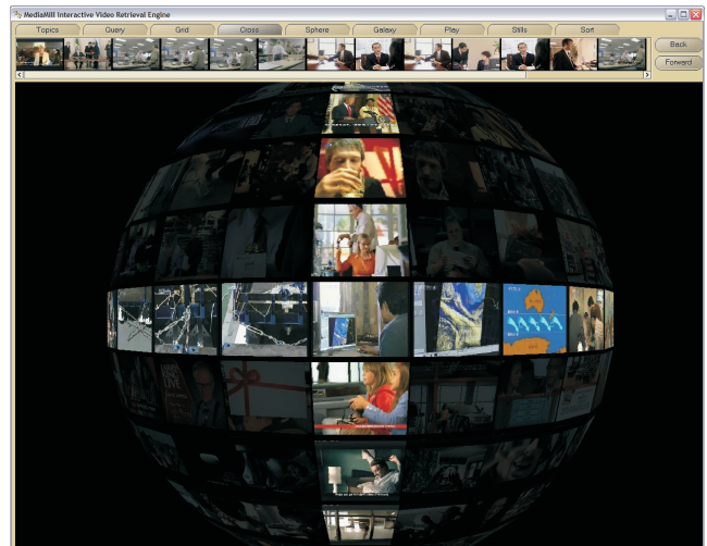
Figure 3: Result of the query in fig. 2 visualized in the CrossBrowser .

The result of concept suggestion, the subsequent concept queries and their combination yields a ranked list of shots. To explore this result the CrossBrowser visualizes the ranked list (vertical axis) versus the time (horizontal axis) of the program containing the shot. The two dimen-